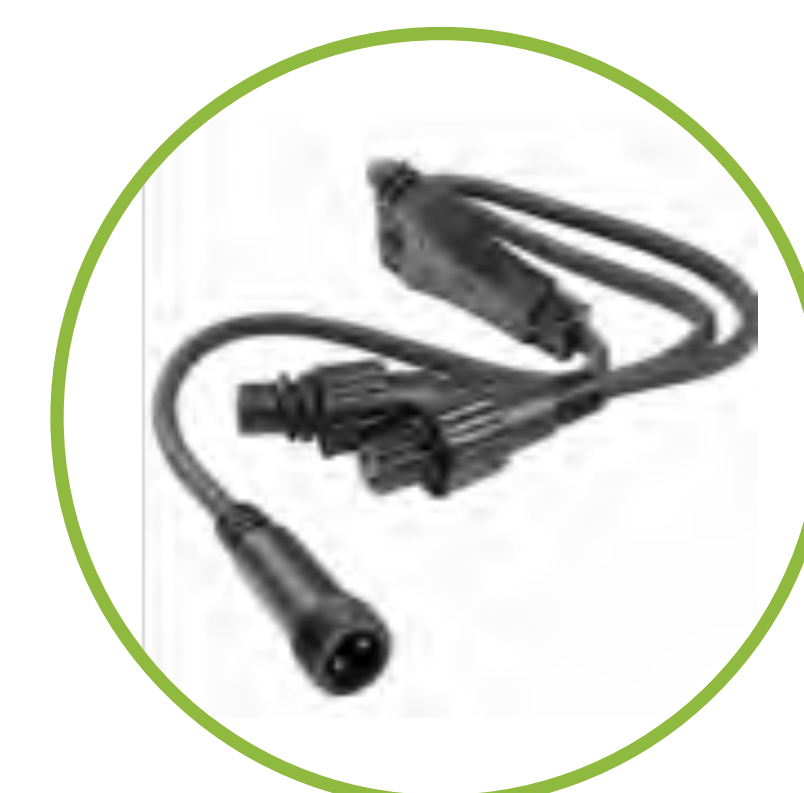
Cords and string lights