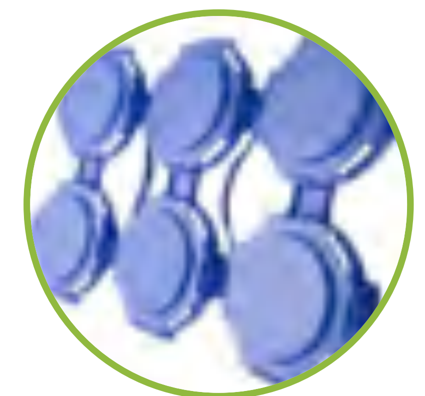
PakTech can handles