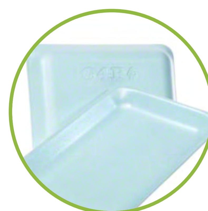
Take out containers, meat trays and egg cartons