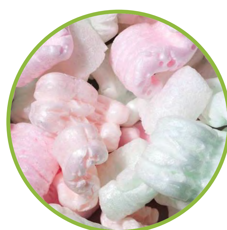
Styrofoam packing peanuts