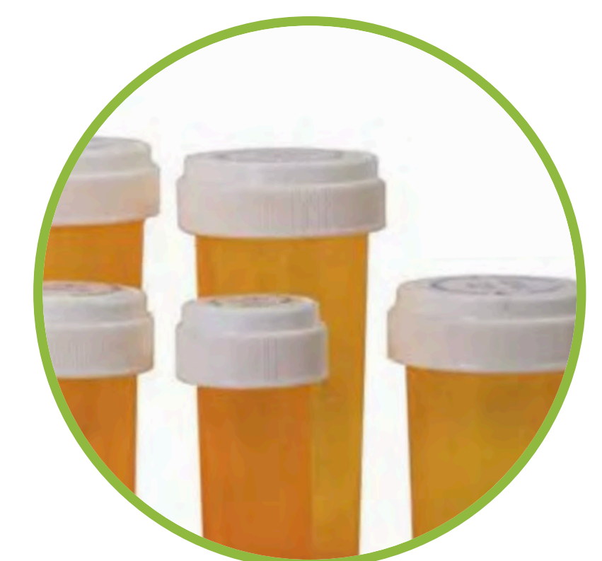
Prescription pill bottles