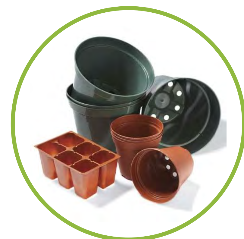
Plant pots under 4 inches and seedling trays