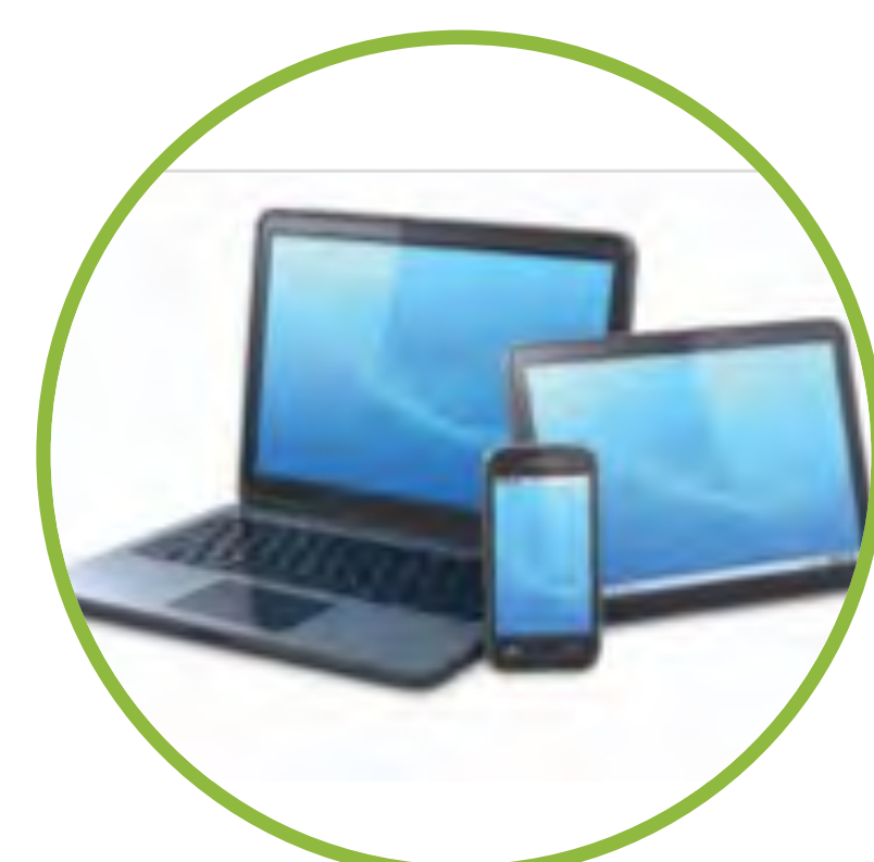
Misc. electronics (no TVs, air conditioners, fridges or dehumidifiers)