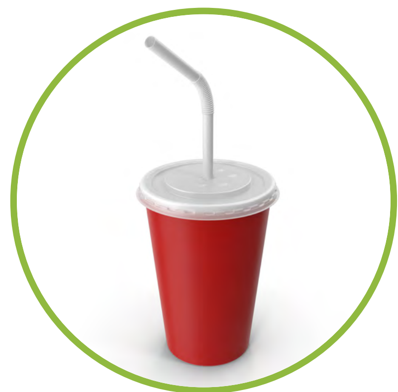
Cold drink cups/lids

All other items must have recycling numbers 2, 4, 5 or 6 and be sorted by resin number (ie place all #2 together, all #4 together, all #5 together, all #6 together) Put each number into a separate bag or container. Below are some examples of numbered plastics: