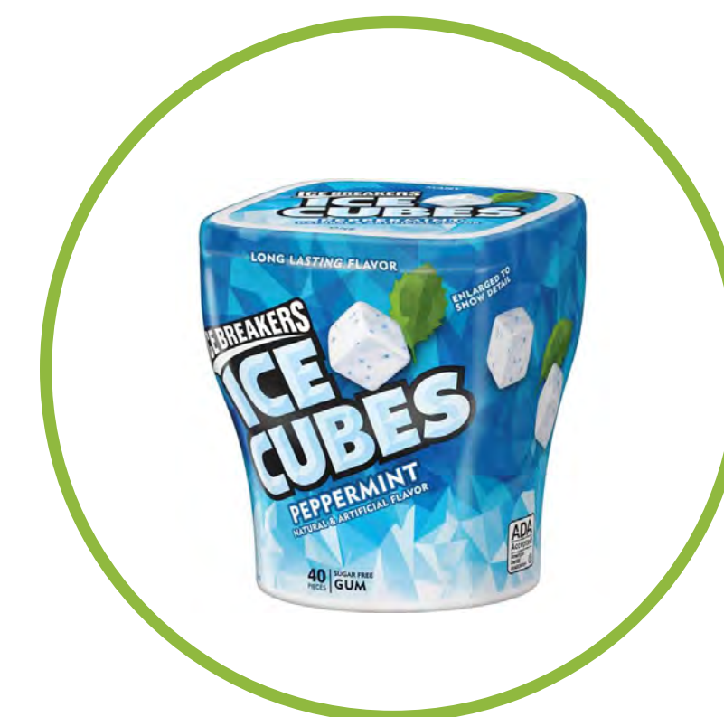
Misc plastic containers