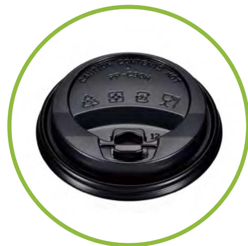
Hot drink lids