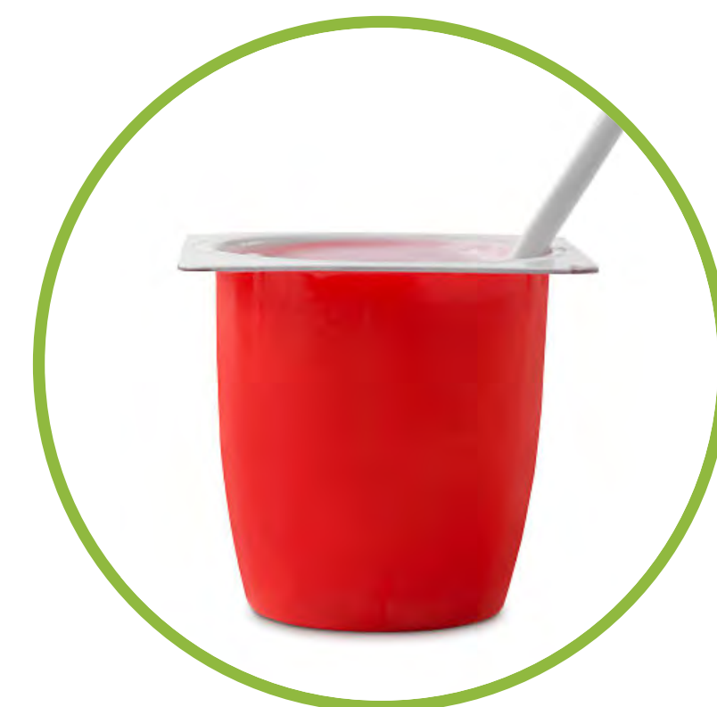
Tubs or containers smaller than 6oz